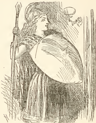
CHRISTIE AS QUEEN OF THE AMAZONS.

your neck, or pick your way like a cat in wet weather, but come with effect , for I want that scene to make a hit."